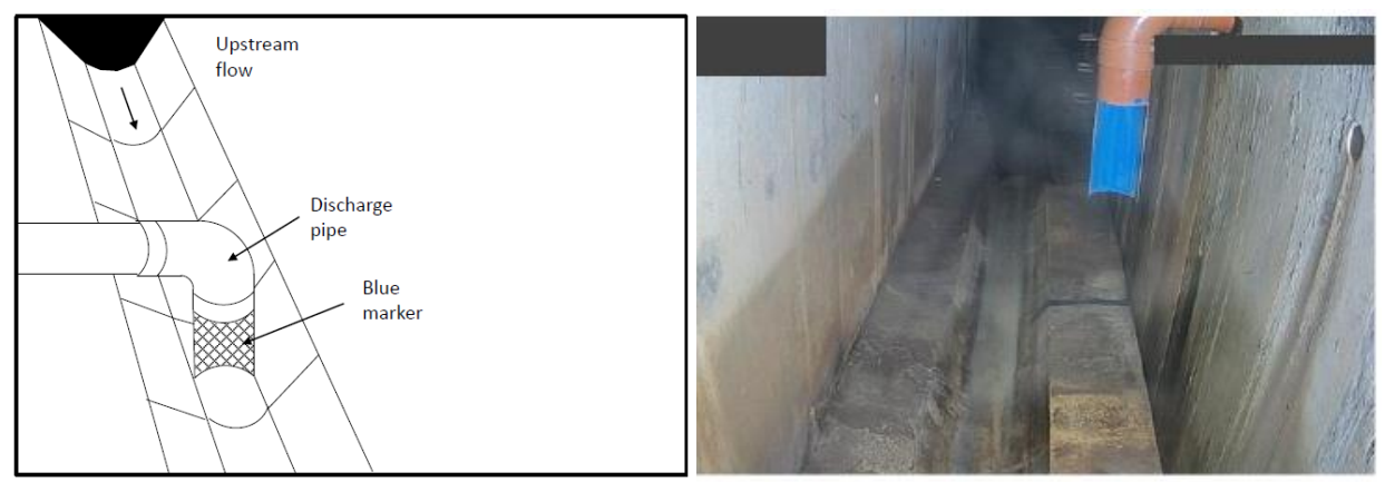
Figure 2. Example of Blue-Marker painted on cut-opened discharged pipe.

(3) The contractor shall operate and monitor the CCTV at all time. The CCTV shall not have more than 4% downtime per month. Alert system such as via sms and/or email, shall be provided to the contractor if the system is not in operation.